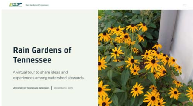
Figure 2. Screenshot of the storymap for Rain Gardens of Tennessee state-wide showcase.

Through technology and social media, it is possible to build a state-wide resource for residents to find information they need to turn the tide from “hey, that’s a clever idea” to “let’s do this!” and produce a wave of adoption across our communities. Taking a cue from the agriculture community where “farmer-to-farmer” programs have shown effective in boosting adoption rates of conservation practices on farms, building a “rain gardener-to-rain gardener” platform may be an effective approach to leverage existing knowledge and crowd source a suite of resources for our audiences. I seek your help in connecting with rain gardeners to help populate a