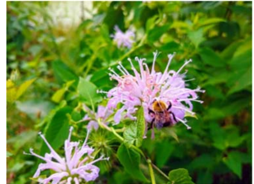
Figure 1. Wild Bergamot ( Monarda fistulosa ) attracts pollinators and is a versatile perennial for rain garden included on the “all-star” selections list.

Whether it’s needing more confidence in their ability to plan and build a rain garden, knowing who to call to provide installation service, or feeling comfortable with the level of maintenance needed to make a rain garden part of their landscape, overcoming these uncertainties takes access to readily-available guidance. At the same time, there are many amazing programs across our state that promote or incentivize these practices that have attracted many early adopters who have rain gardens already. We as a community of stormwater professionals should leverage this experience and example of early adopters to recruit more residents into the fold.